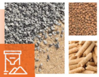
MINERALS & FUELS

"You produce, and we fill the bags for you."