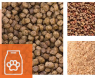
ANIMAL FEED & PET FOOD